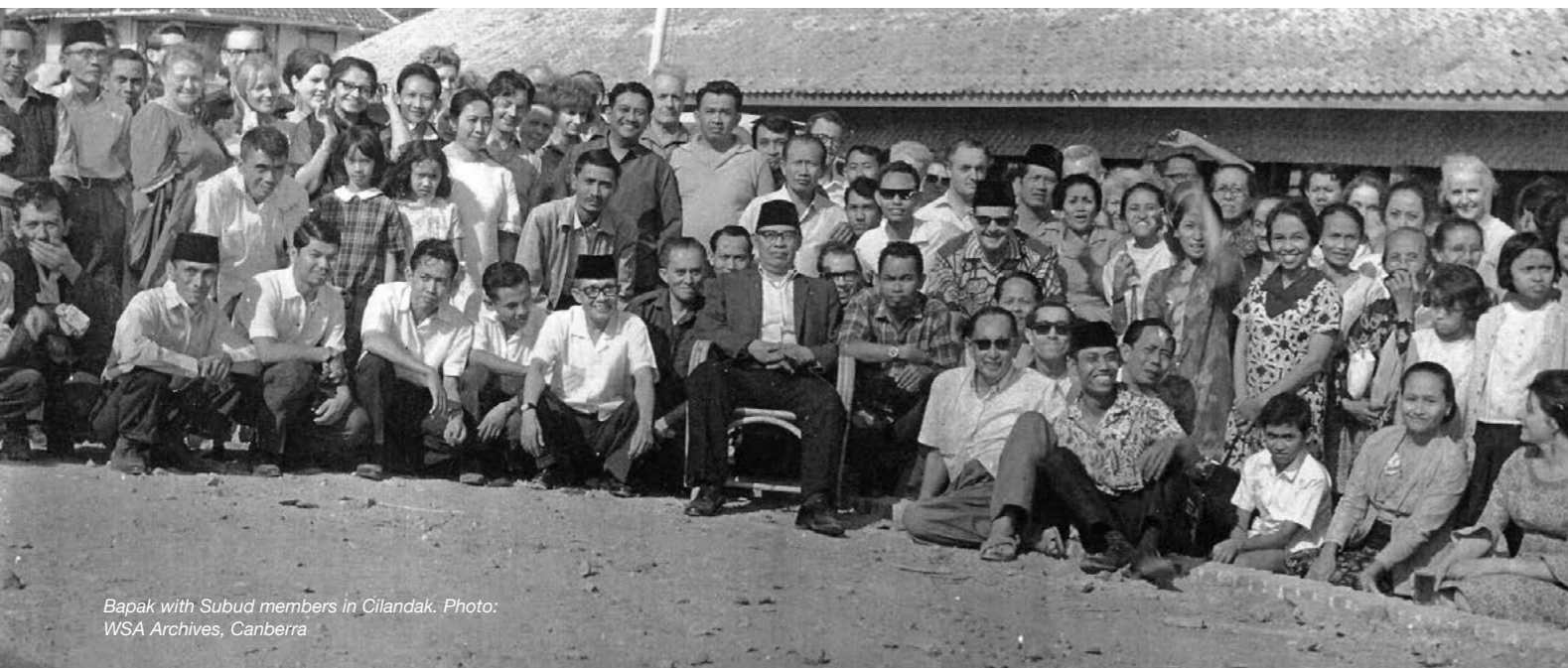
Bapak with Subud members in Gilandak.