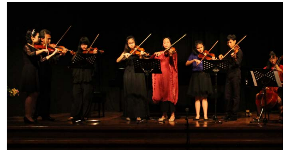
Music is at the heart of the school but now other forms of artistic expression are being taught.