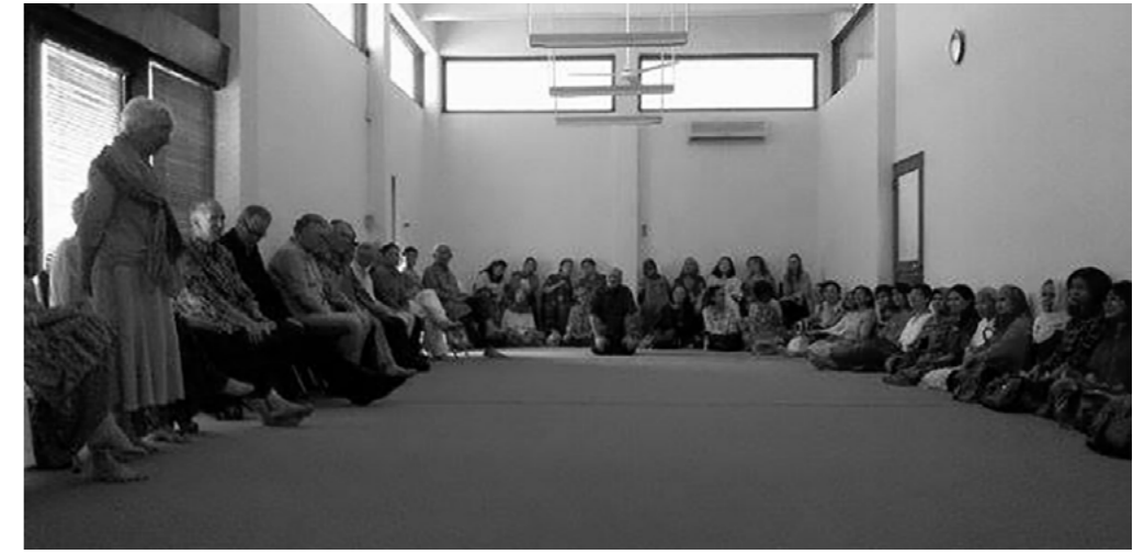
IH's share experiences with local helpers in Wisma Subud