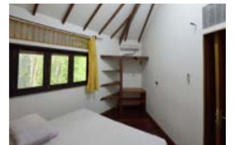
Inside one of the newly refurbished rooms.

"I need one more cabin", says Amaliya, "to satisfy the growing demand and I hope to apply for one of the three grants being offered this year by MSF for eco housing."