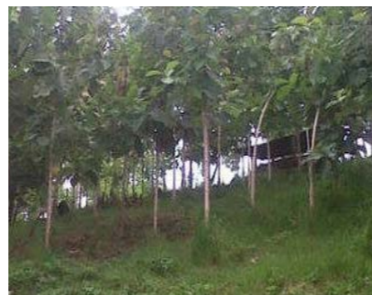
The vast majority of commercial teak is grown in Indonesia.