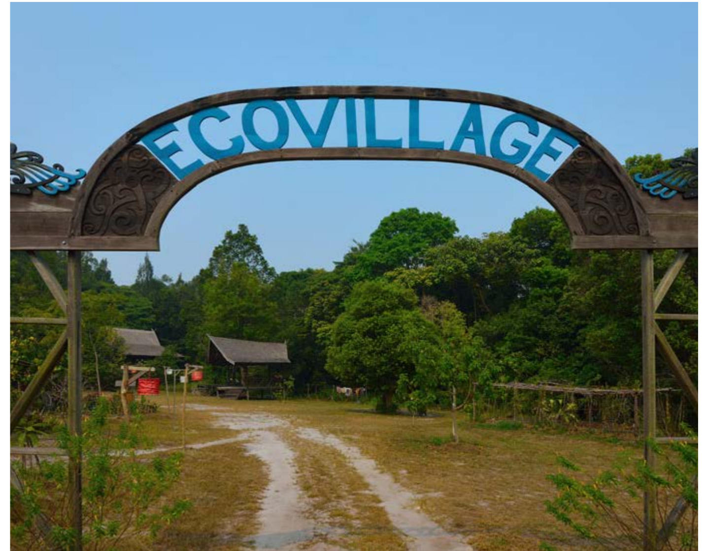
Welcome to the Eco Village located inside the Subud complex known as Rungan Sari in Central Kalimantan

By 2010 we were attracting larger and larger groups. The companies would hold their training sessions here. They not only came to the