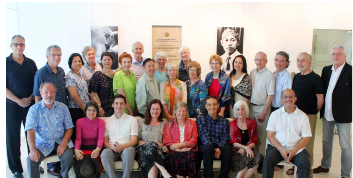
World Subud Council at Adi Puri, Bapak's former home in Wisma Subud, Cilandak, Indonesia