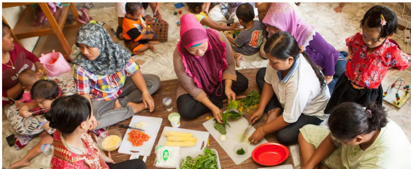
Healthy cooking classes have proved to be very popular in local villages.

“The aim of the home garden program at the family level is to get organic fresh vegetables and protein to the participants on a year round basis. Families grow vegetables and raise chickens and fish for protein in a sustainable and practical way. This was a hope but it had to be something that would make sense to the participants and that they could do on their own and thereby observe their own success,” said Daniela.