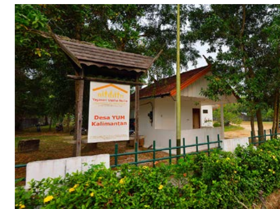
YUM Village in Central Kalimantan

For more information on the work of YUM in Indonesia log onto http://www.yumindonesia.org/