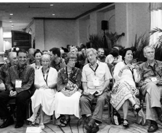
Members of WSA at the Indonesian Congress